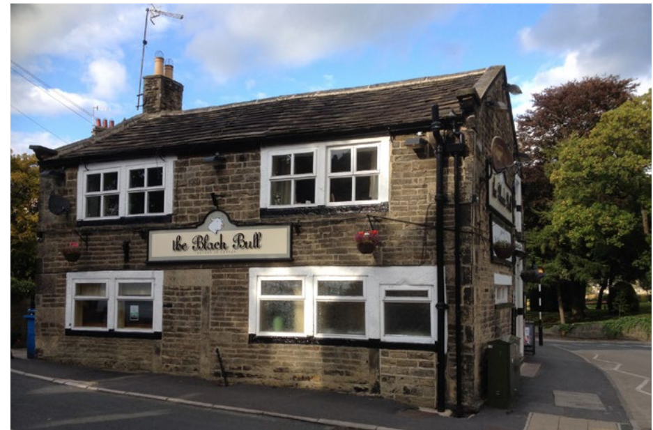
The Black Bull Inn