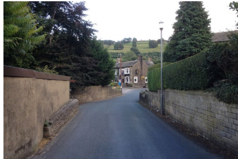
HF2: The view SE down Ellers Road

HF3: View from the Bay Horse Inn 'Edge of settlement' historic view of open countryside. Strong view of Steeton and Sutton Moors.