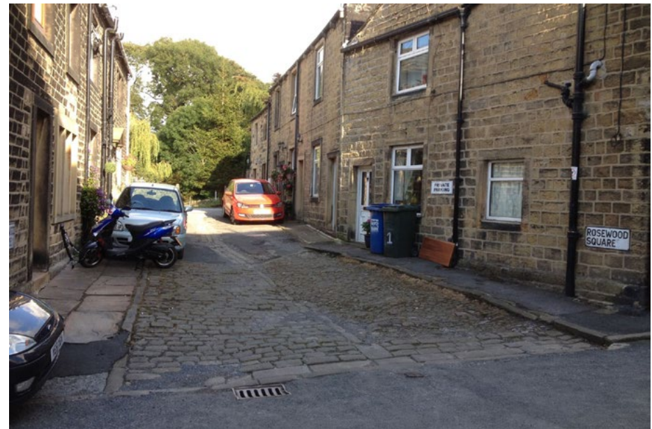
Gritstone cobbles and setts at the western end of Rosewood square