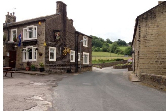
Bay Horse Inn