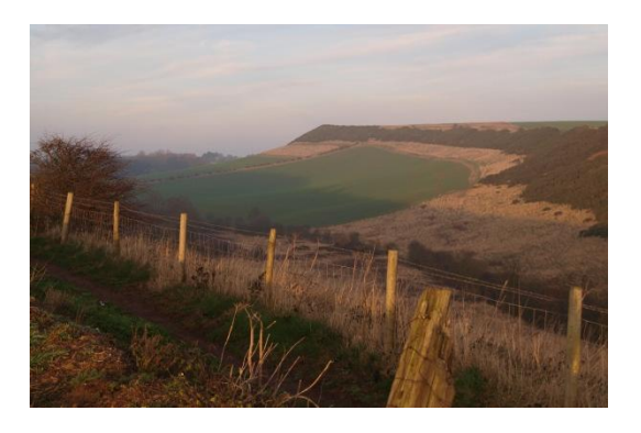
Expansive, open arable farmland site