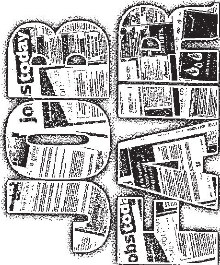
The Wakefield Express