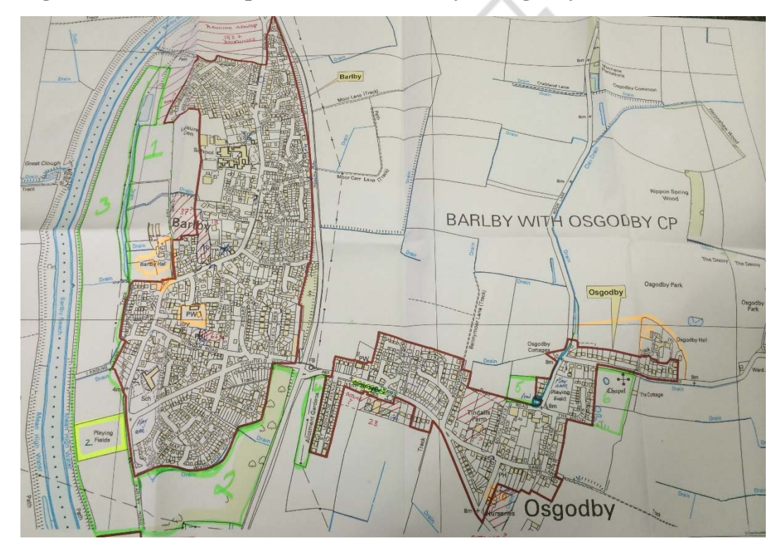
Figure 3.1: Potential expansion land in Barlby & Osgodby

The areas of potential expansion land are shown as red stripes on Figure 3.1 below: