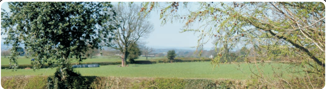
B From Copt Hewick looking north west.