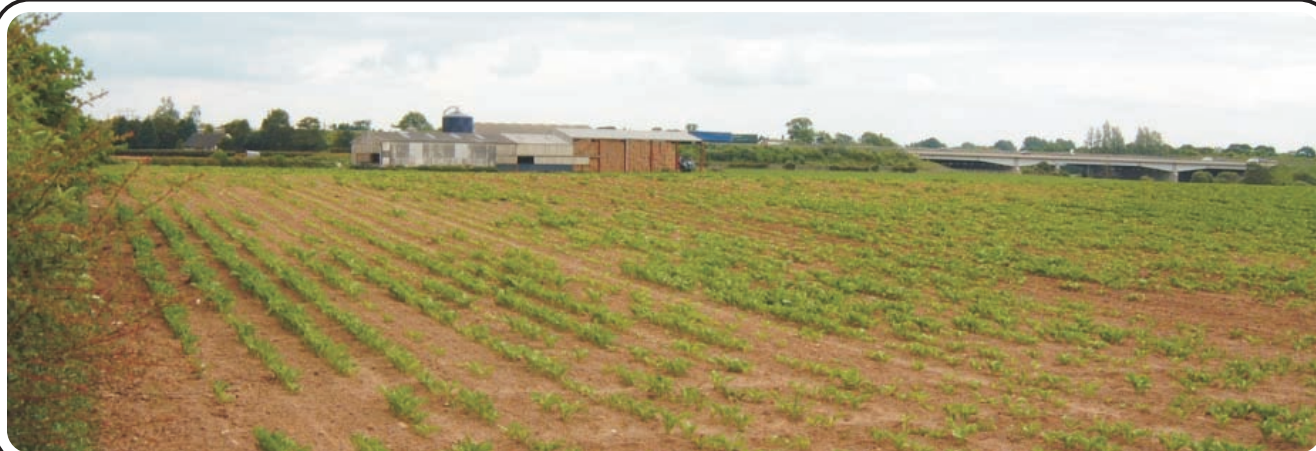
B Farmstead on eastern edge of Character Area.