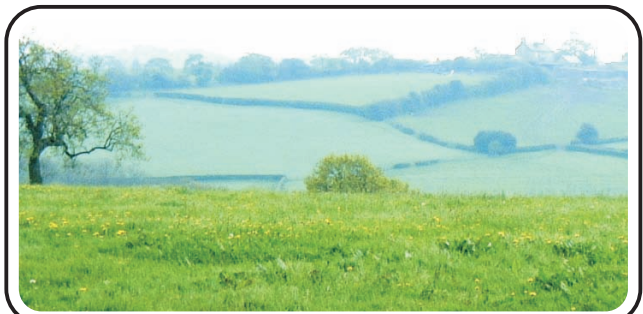
B From Hill Top Lane to Brackenthwaite.