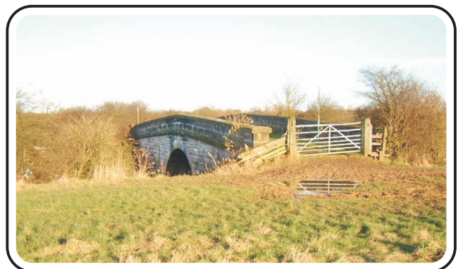
B Bridge over the dismantled railway track (now a foot and cyclepath).

The area is the subject of a Local Heritage Initiative project along with Character Areas 53 and 54.