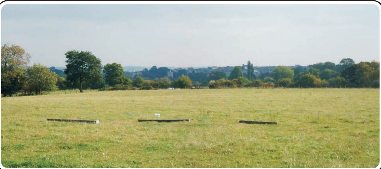
B Looking east to Knaresborough from Bilton Hall Drive.