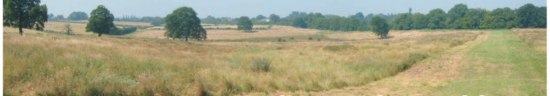
A Looking south-west from north of Forest Moor.