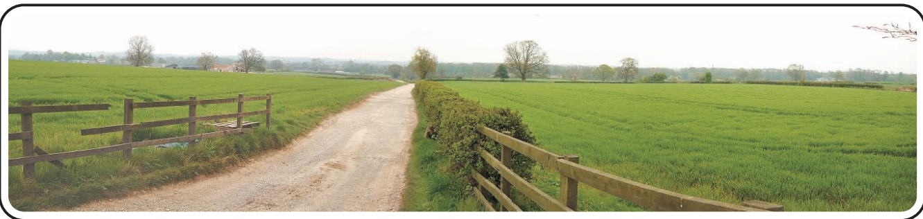
B Farmland north of Hollin Hall off the A61 looking east.