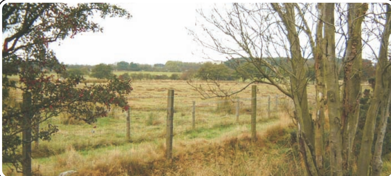
▶ Looking north from track off B6451.