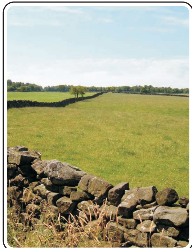
B View across fields from Day Lane.

This area is within the designated Nidderdale Area of Outstanding Natural Beauty.