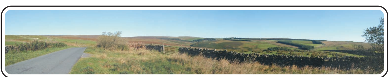
C Looking north-east to Thornthwaite with Padside.