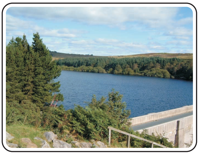
B Over the dam of Thruscross reservoir.