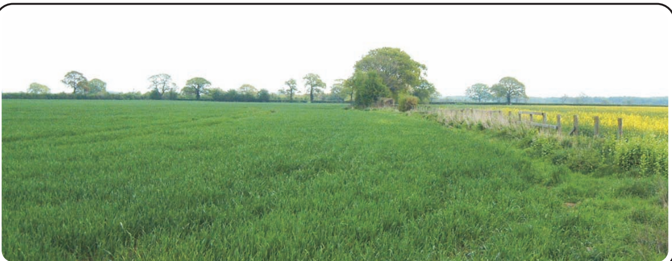
☐ Looking east from Bilton Grange.