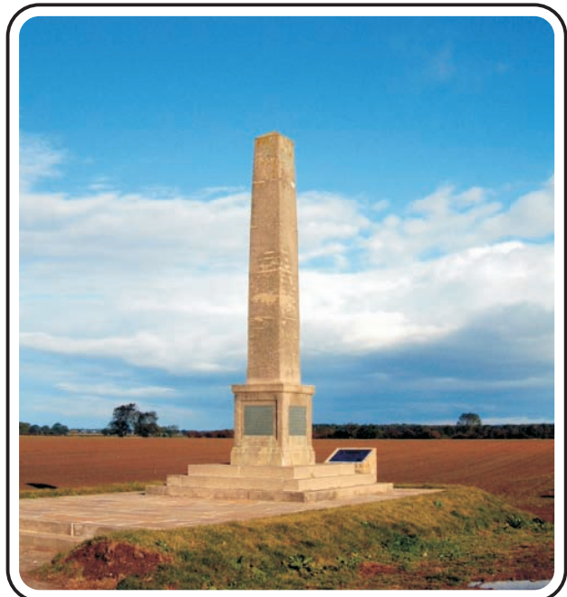
B The Marston Moor memorial.