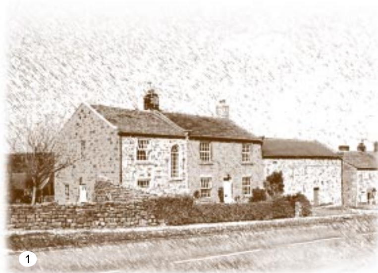
Cherry Tree Cottage

The advice we have had from the officers of the Council and the AONB Project has been of great value to us and we would like to thank the Parish and District Councillors for all their support.