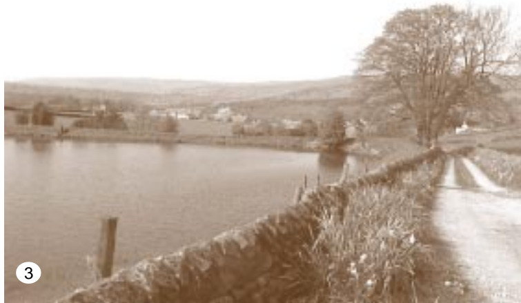
View of the village from top of Fringill Lane - sitting in the valley

Nidderdale consists of a valley about twenty-five miles in length, which has been carved mostly out of Millstone Grit. Lower down the valley, flood waters from the River Ure during the last ice age modified the topography of the lower valley giving Darley its modern landscape. 1