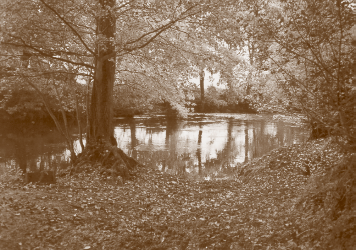
Typical views of the village footpaths