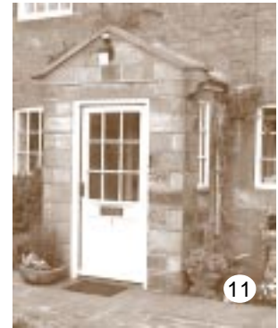
Cottage off Stocks Green