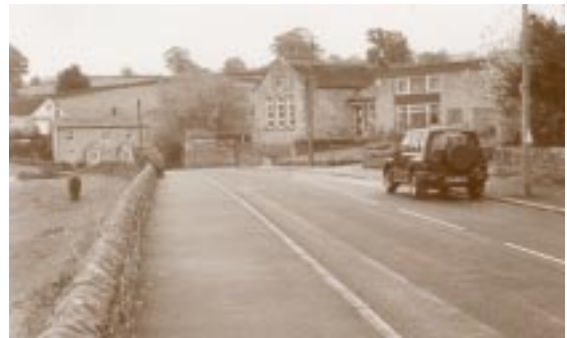
Typical 'through views' from the village.