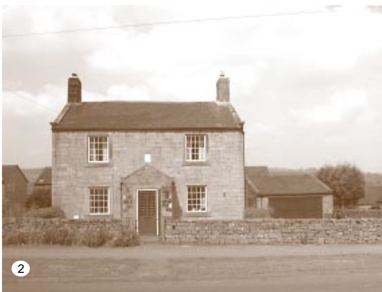
Station Lane House

Following an initial "Open Public Meeting" which was well attended by many villagers at The Wellington Public House (photo 5), two further "Open Workshops" were held in the Autumn of 1999. As part of the work-shops, villagers carried out a photographic survey of the village noting items of special character, design or historical significance. A smaller working group was then set up which met regularly to draft the Statement. Sub-groups investigated the footpaths, trees historic buildings etc. A comprehensive external consultation is covered in Appendix 3.