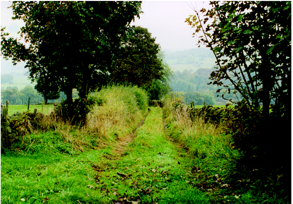
Typical views of the village footpaths.