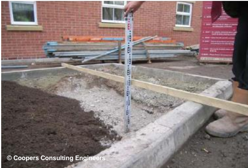
Photograph 1: Depth check of inert cover within area of public open space. Physical break layer and topsoil visible.