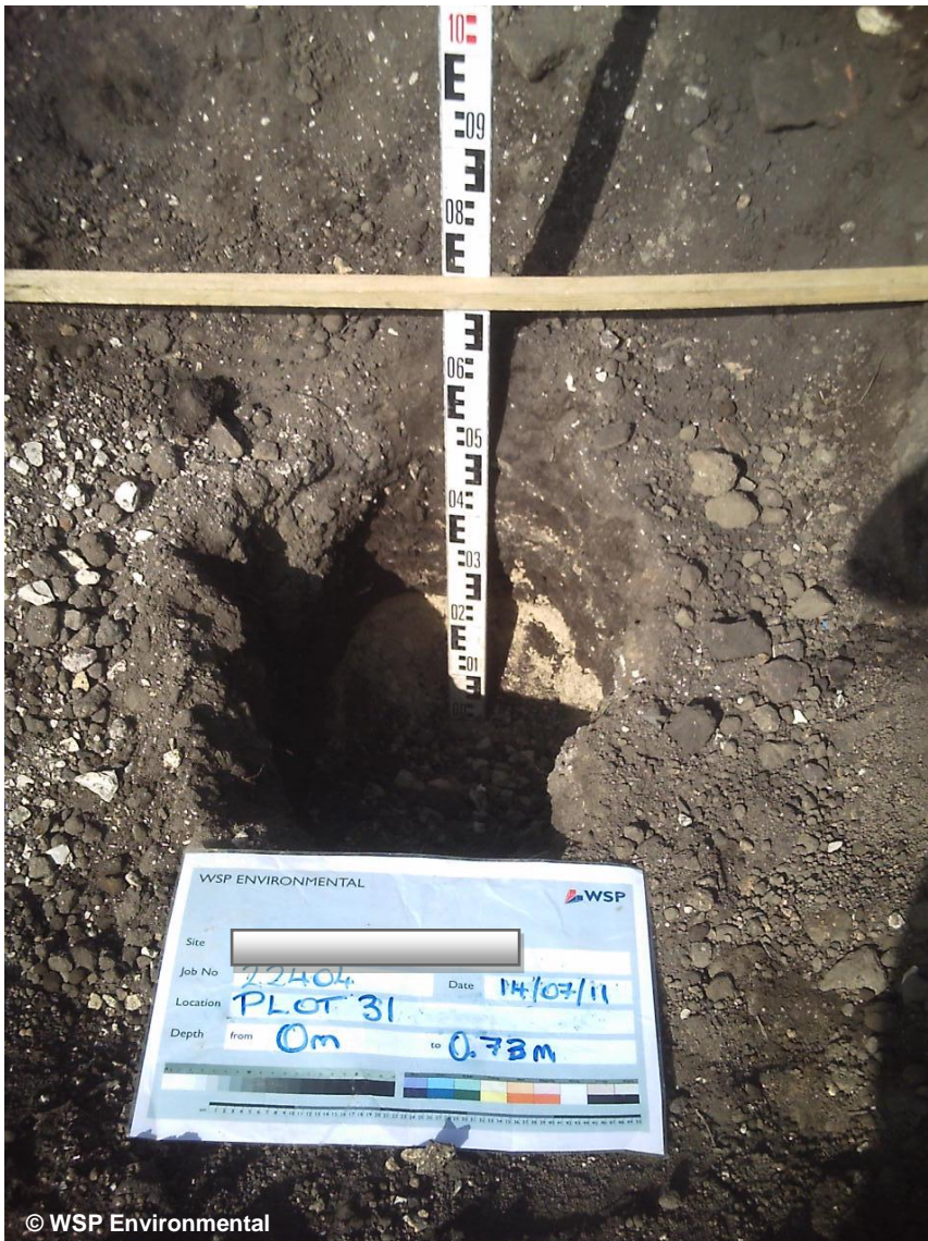
Photograph 2: Depth check of inert cover with Site & Location Information Board.