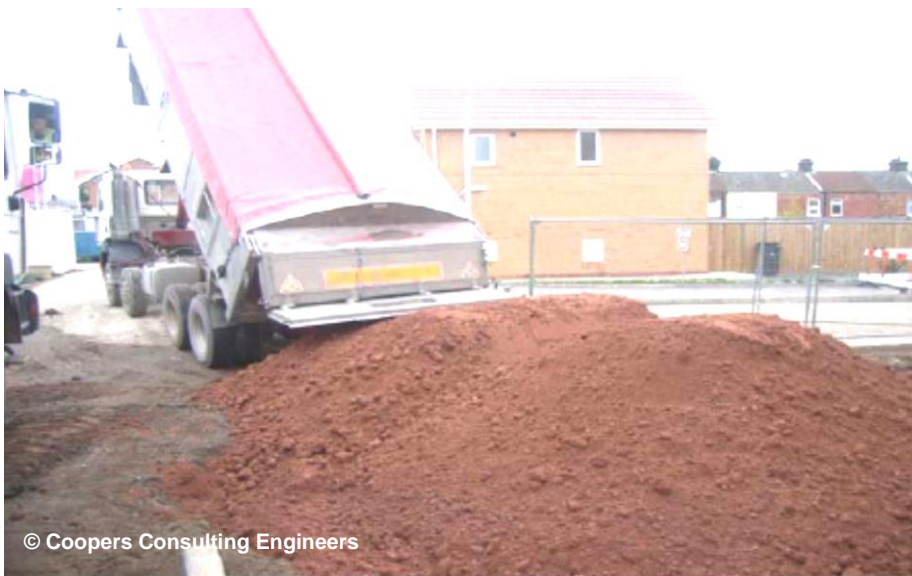
Photographs 9 and 10: Inert crushed sandstone being delivered with remediation break layer visible in Photograph 10. The spatial area of the remediation can be observed from these photographs (old terrace housing in Photograph 9 and traffic lights in photograph 10).