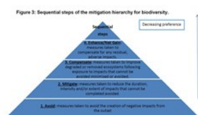
Figure 3: Sequential steps of the mitigation hierarchy for biodiversity [click on image to enlarge]

(/media/11693/gi-and-biodiversity-spd-figure-3.jpg)