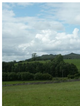
Figure 12: The SINC designation and Sharphaw Hill, as viewed from Park Wood Drive, Skipton [click image to enlarge]

(/media/11718/sinc-sharphaw-from-park-wood-drive.jpg)